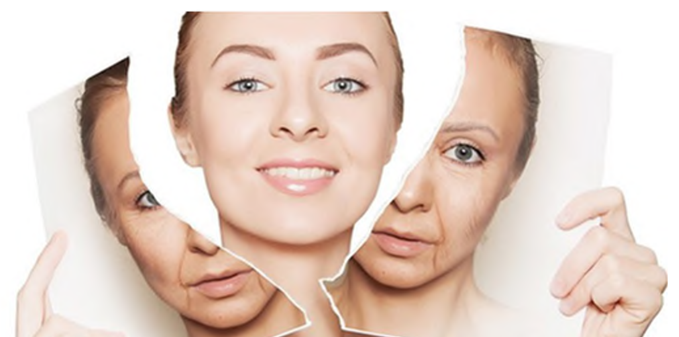
Beauty salon anti-aging