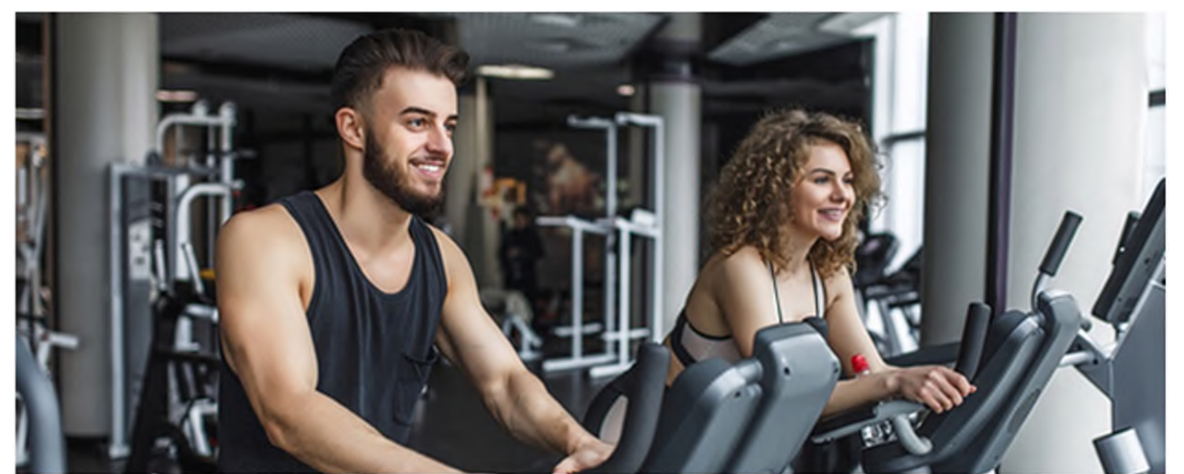
Rapid recovery after exercise