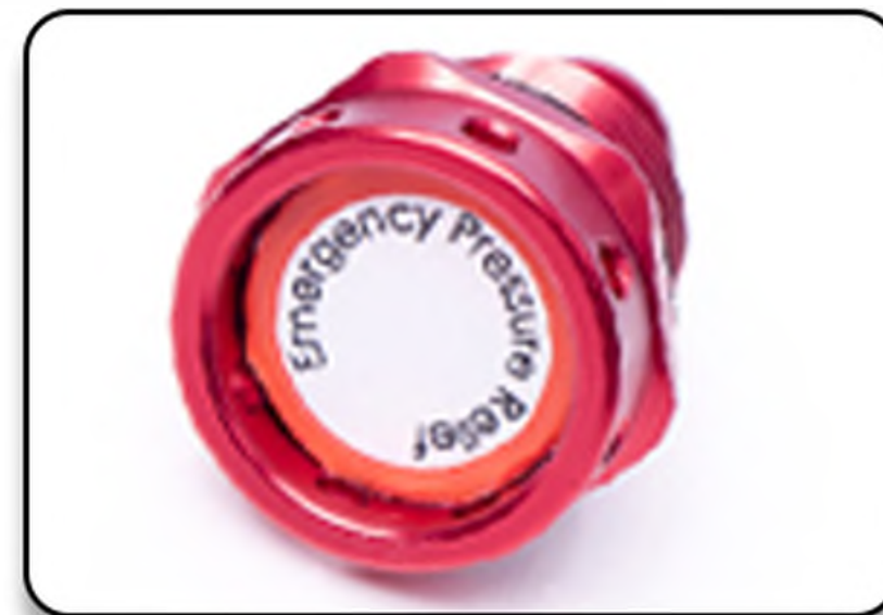
Emergency Relief Valve