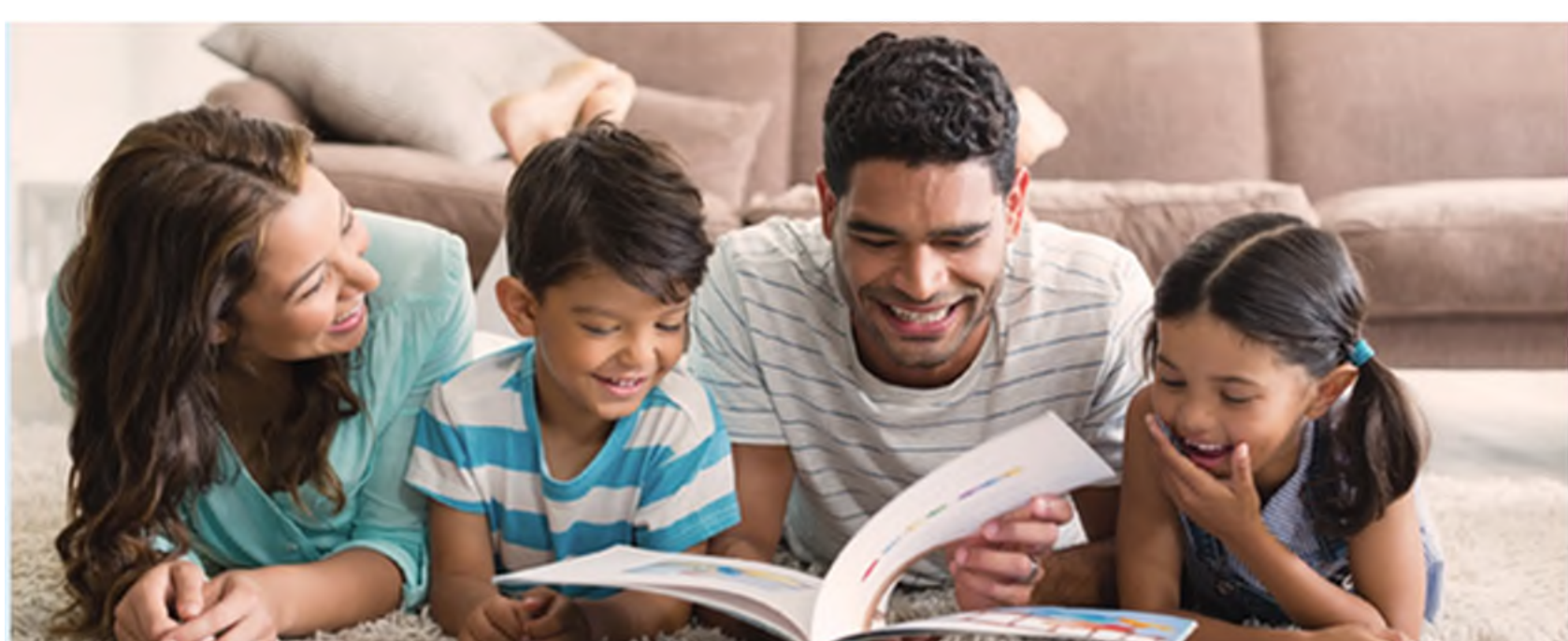
Family health management