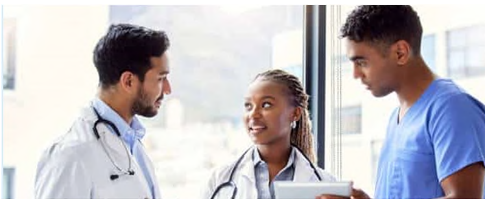
Adjuvant treatment of some diseases