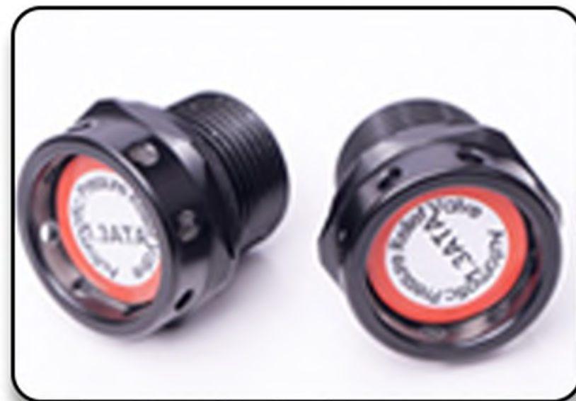
Automatic Pressurize Relief Valves