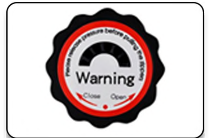
Air Deflate Value